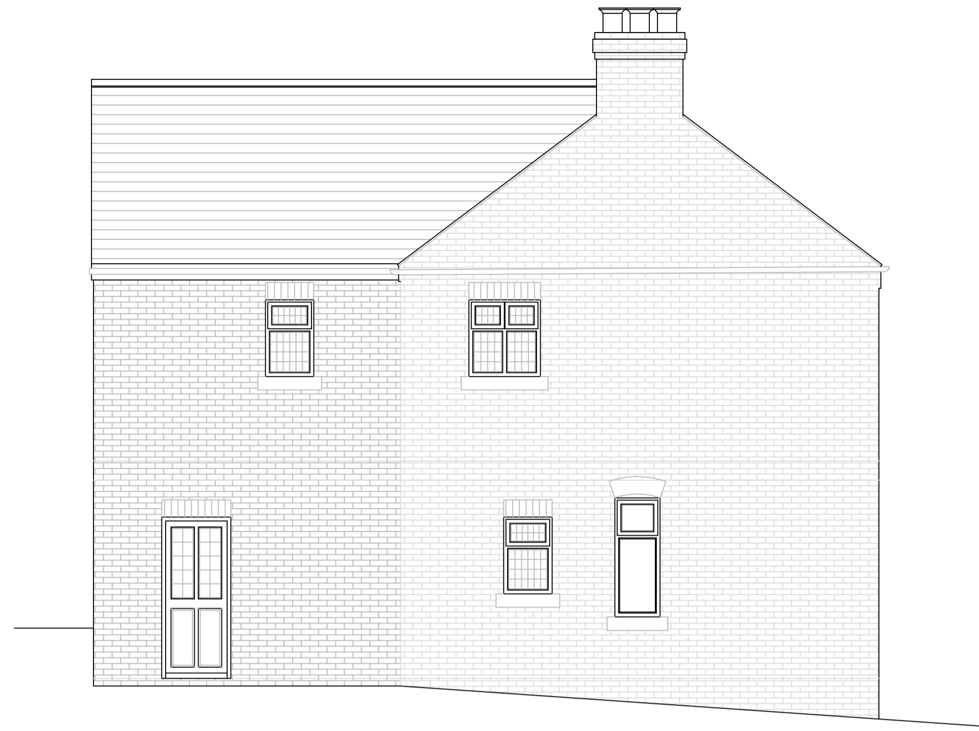
SIDE A ELEVATION